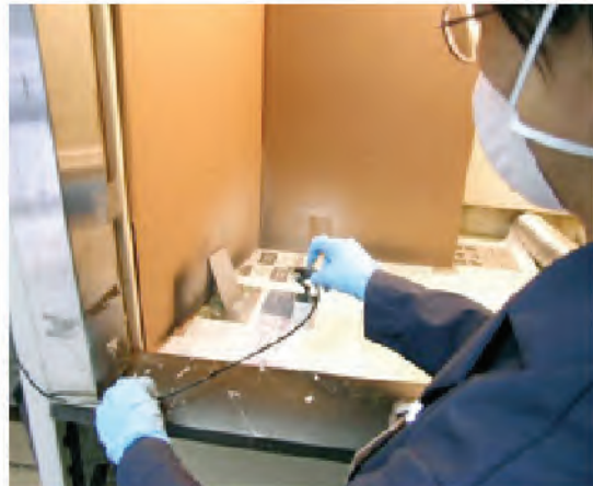
Paint Deposition Laboratory Process

monitoring temperature of critical components, such as engines and nacelles in ground checks. This technology can be further extended into power generation, where the temperature of large turbines could be monitored, providing early warnings of failure.